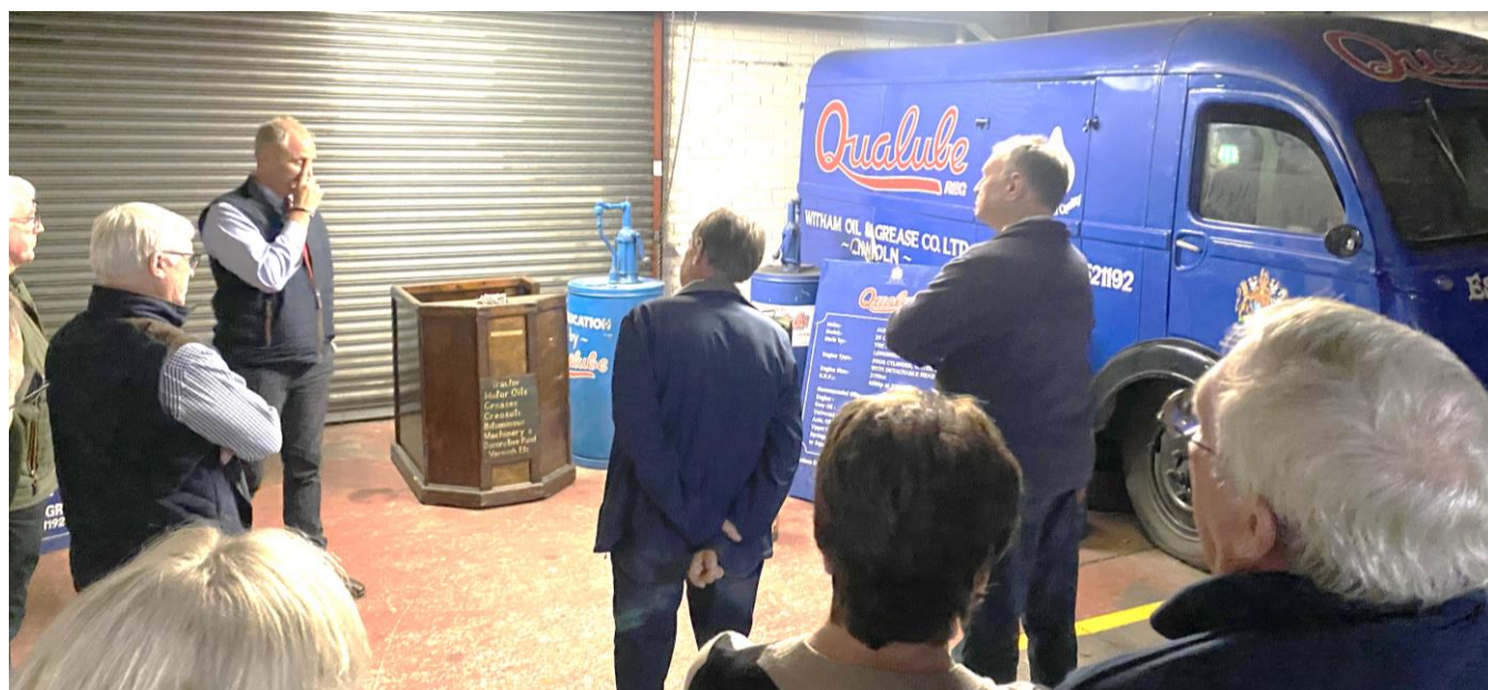
An old Austin delivery vehicle owned by Witham Oil was on show as part of SEECCC's tour at their Lincoln factory