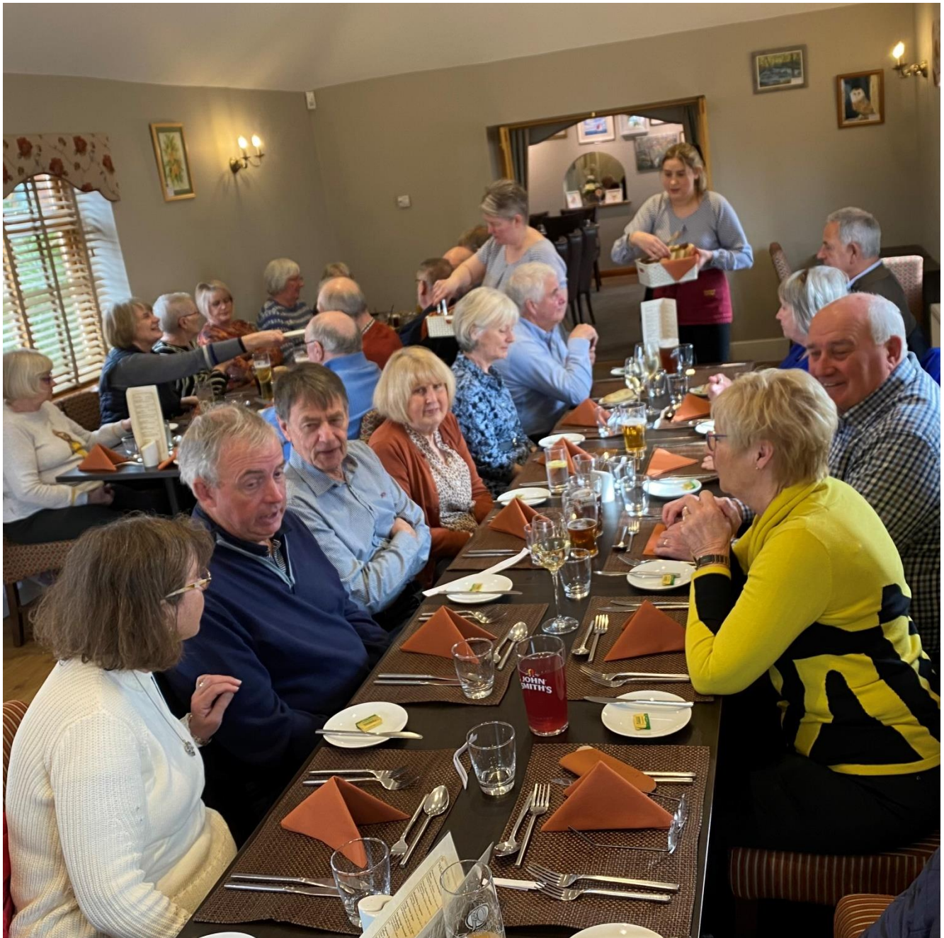
The midweek lunch at the Thatched Cottage, Sutterton last month was well supported