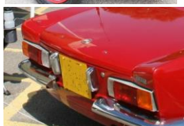
Fiat 124 Spider