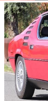
Alfa Romeo Montreal