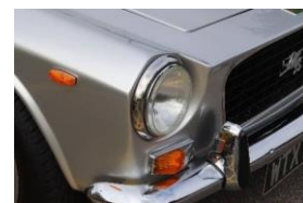
Gilbern Invader Mk 1