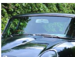
Jaguar E type S1