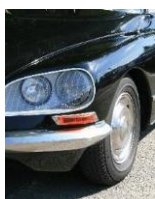
Citroen DS 21