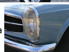
Mercedes 230SL Pagoda