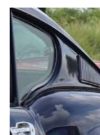
Triumph GT6 Mk3