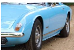
Lotus Elan +2