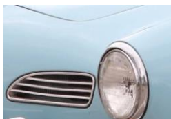
VW Karmann Ghia