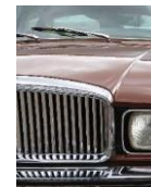
Vanden Plas 1500