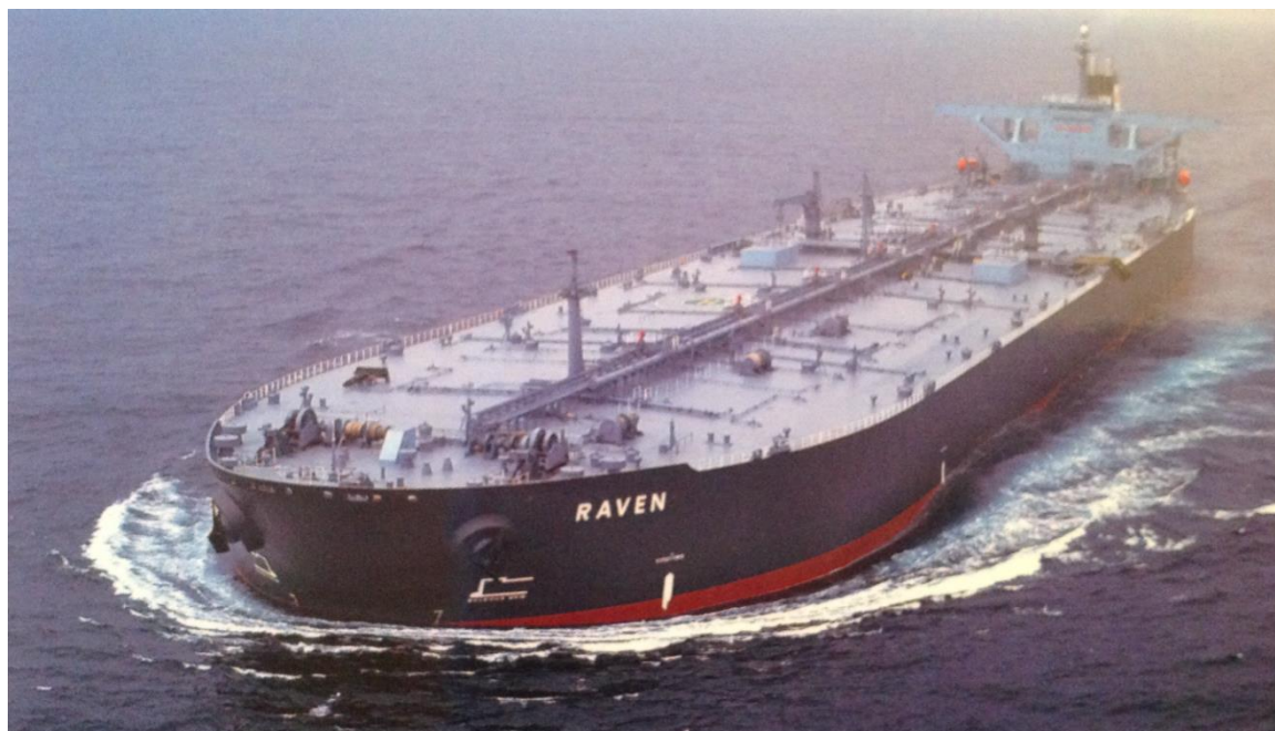
MT RAVEN was 332 metres long and 58 m across

In 2000, Mobil Oil was merged (taken over), by Exxon and became ExxonMobil. Things did not change too much except that in 2003 I was invited to come ashore as a Marine Superintendent within the new company. This proved to be very rewarding in that my roles involved aiding the international fleet, liaising with owners who wanted their new-build tonnage to be time chartered by ExxonMobil and looking at potential ports around Europe to accommodate the latest LNG carriers being built.