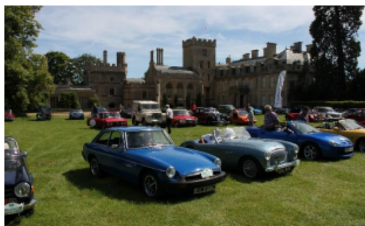
Entrants from our 2018 run which finished at Elton Hall.

We will start from Waterside Garden Centre, King Street, Baston, PE6 9NY and take a circuitous route through pleasant Lincolnshire, Rutland and Leicestershire countryside and villages, passing places of interest, using mainly rural roads, to finish at the historic and magnificent Burghley House, Stamford.