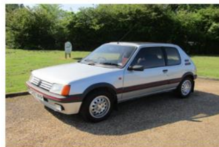
1989 Peugeot 205 1.6 GTi

http://www.angliacarauctions.co.uk/en/classic-auctions/